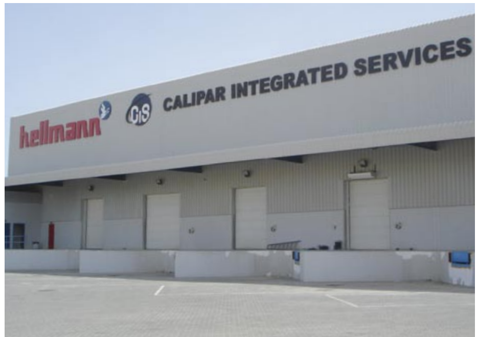
Outside view on the warehouse

Hellmann Worldwide Logistics is a family-owned company, established in 1871 at Osnabrueck, Germany. Today, this global logistics network operates facilities in 443 offices in 157 countries, employing in excess of 16,500 dedicated people. Hellmann established its presence in the Middle East in 2002 with its headquarters in Jebel Ali free Zone, Dubai and also with a branch in Abu Dhabi. Since then, their presence in the UAE has grown to 7 offices. Hellmann's service offerings include Road freight, Air freight, Sea freight, Sea, Air, Contract logistics, Customs brokerage and E-commerce. Hellmann has got a good presence in the UAE with its 60,000 sqm warehouse (with more than 9,000 sqm dedicated for pharmaceutical products). They celebrated 8 years in the market by getting six customers from six different industries.